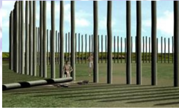
Artist's conception of Stubbs Woodhenge, located at the present site of the Little Miami High School football grandstands

Did you know that what's now the Little Miami State Park has been inhabited for over 10,000 years, and that artifacts have been found on the plateau that occupies the Ft. Ancient earthworks that date to 5000 BC, five millennia before the Hopewell culture built the earthworks there?